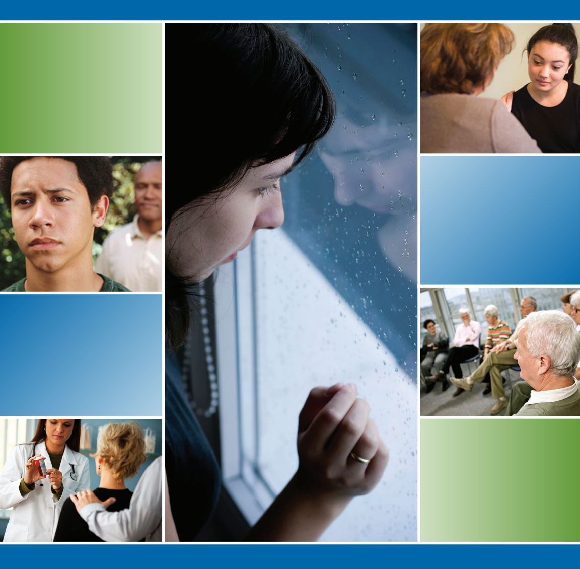
U.S. Department of Health and Human Services National Institutes of Health